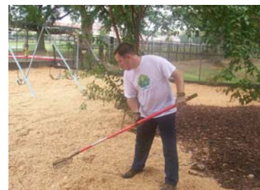
Albemarle Foundation employees purchased and installed our new playground surfacing.

Look for additional pictures in our next edition of Now Hear This!